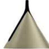
greige / black