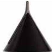
black / gray