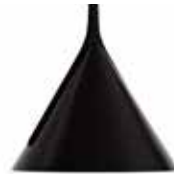
black / black