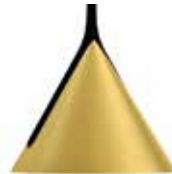
gold / black